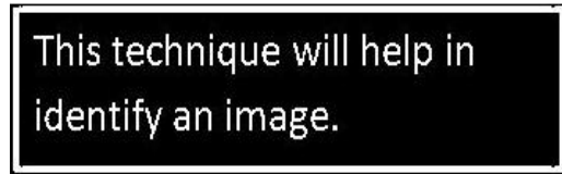
Figure 4.4: Pre-processed image of printed text (synthetic image)

The captured image inverted and it is cropped to the required size. The cropped image is converted into digital form. The pre-processed printed text (synthetic image) is shown in the figures 4.4. The preprocessed printed text(test image) and handwritten text images are shown in the figures 4.5 and 4.6 respectively.