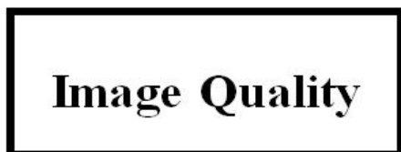
Figure 4.2: Captured image of printed text (Test image)