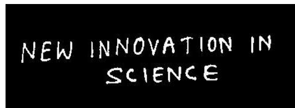
Figure 4.6: Pre-processed image of Handwritten text