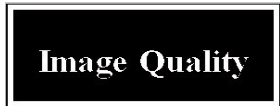
Figure 4.5: Pre-processed image of printed text (test image)