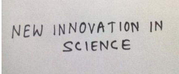
Figure 4.3: Captured image of Hand written text